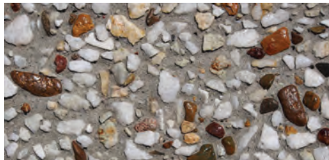
Murray Exposed (sealed)

EXPOSED For driveways, pathways, landscaping and other outdoor applications, Geostone exposed is the perfect solution, combining stunning good looks and a highly durable and skid resistant surface.