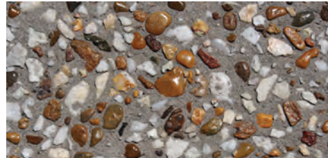
Macleay Exposed (sealed)