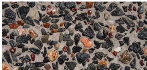
Kureelpa Exposed (sealed)