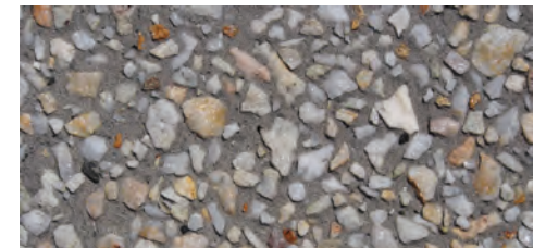
Richmond Exposed (sealed)

HONED For outdoor entertaining, alfresco and pool surrounds Geostone honed provides a similar level of comfort underfoot to Geostone polished with the practicality of Geostone exposed. All Geostone exposed products can be honed.