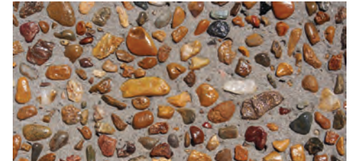
Hunter Exposed (sealed)