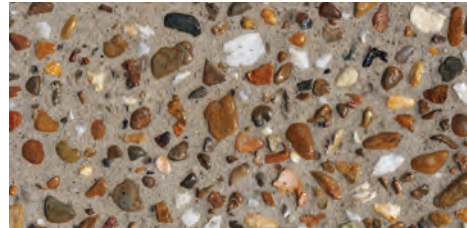
Clarence Exposed (sealed)