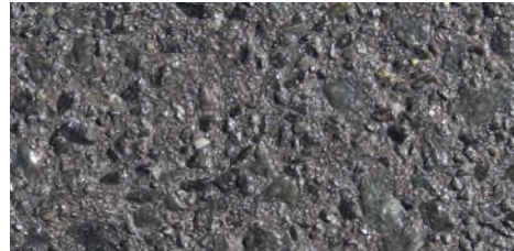
Nu York Exposed (sealed)

EXPOSED For driveways, pathways, landscaping and other outdoor applications, Geostone exposed is the perfect solution, combining stunning good looks and a highly durable and skid resistant surface.