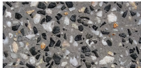
Torrens Exposed (sealed)