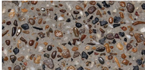
Sansana Exposed (sealed)