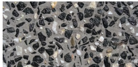
Yarra Exposed (sealed)