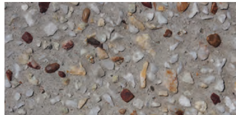
Kiamba Exposed (sealed)