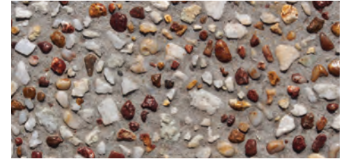
Rosemount Exposed (sealed)