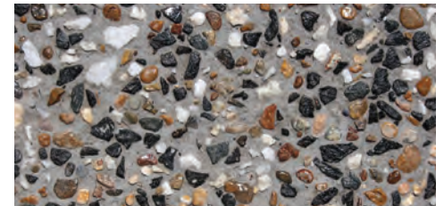
Ramshead Exposed (sealed)