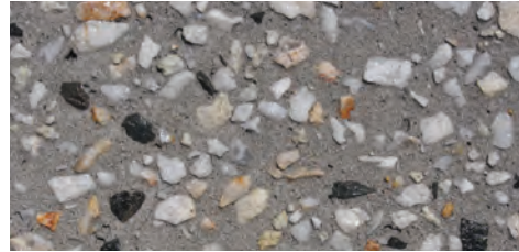
Noosa White Exposed (sealed)