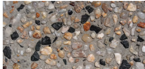
Kawana Sands Exposed (sealed)