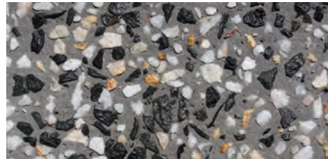
Ninderry Exposed (sealed)

Disclaimer: The product samples displayed in this brochure are indicative only of the finished product and no guarantee of the coloured or textured finish is given or implied. This is because colour and texture can vary due to many factors, including reproductive differences between the photographs in brochures, samples and displays and the actual product. There can also be variations in the consistency, appearance, quality and texture of natural ingredients, variations in colour additives, variations through the addition of water to the concrete, and from handling, placement and finishing techniques. For a closer representation of the samples displayed in this brochure please visit one of our Display and Selection Centres and discuss your requirements with your local Holcim representative. Holcim does not prepare the site or install or finish any product. For further information on preparation, installation and finishing touches (including sealing) please refer to our Handy Hints and Tips sheet and Best Practice Placement Guide. All Geostone products are supplied on Holcim's standard terms and conditions of sale.